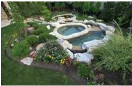
The spa and waterfall descend to a fishpond fed by a separate water source.

Stone became the defining feature of the architecture, interior design and landscape. Instinctively inspired by the family's Sun Valley vacation home, the wife rejected the idea of building with the cool hues of regional bluestone. She searched all the way to Utah to find the warmer Mountain Valley quartzite/sandstone for the three-inch-thick pool deck, spa and parts of the terrace. Decker designed the pavilions and stone columns with a split Western Maryland stone veneer. Fendrick used local Carderock in a grand lawn-and-boulder staircase that ascends from the house.