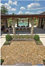
An intricate mosaic of hand-laid pebbles surrounds the grill.