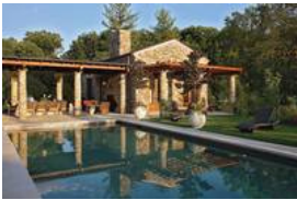
The poolside pavilion houses a spa bath and art studio.