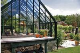
The working side of the garden is defined by the presence of an imported English greenhouse.